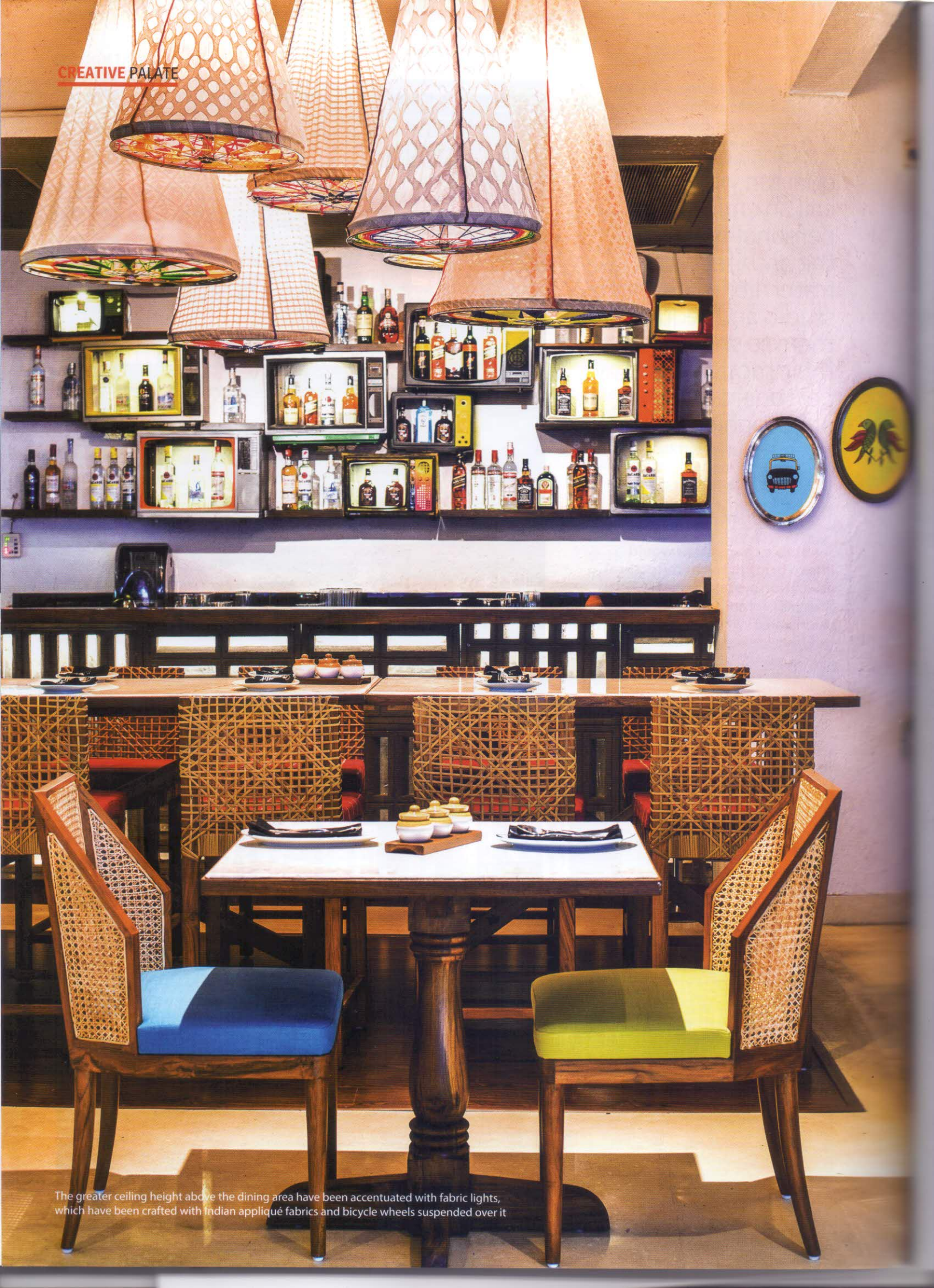
The greater ceiling height above the dining area have been accentuated with fabric lights, which have been crafted with Indian appliqué fabrics and bicycle wheels suspended over it