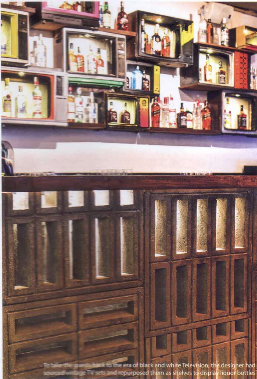
To take the guests back to the era of black and white Television, the designer had sourced vintage TV sets and repurposed them as shelves to display liquor bottles

had specifically sourced the vintage TV sets and repurposed them as shelves to display liquor bottles. The bar apron and the live kitchen apron are created with cast cement lattice blocks.