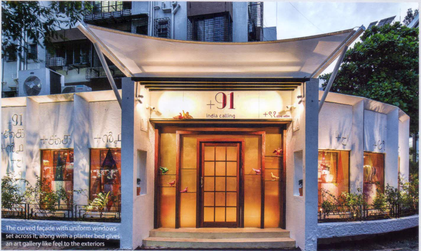
The curved façade with uniform windows set across it, along with a planter bed gives an art gallery like feel to the exteriors

“The interiors of the restaurant have been effectively adorned with art installation which are housed in the window niches with colourful thread work screens serving as a backdrop to the sculptures as well as lending privacy to the diners inside”