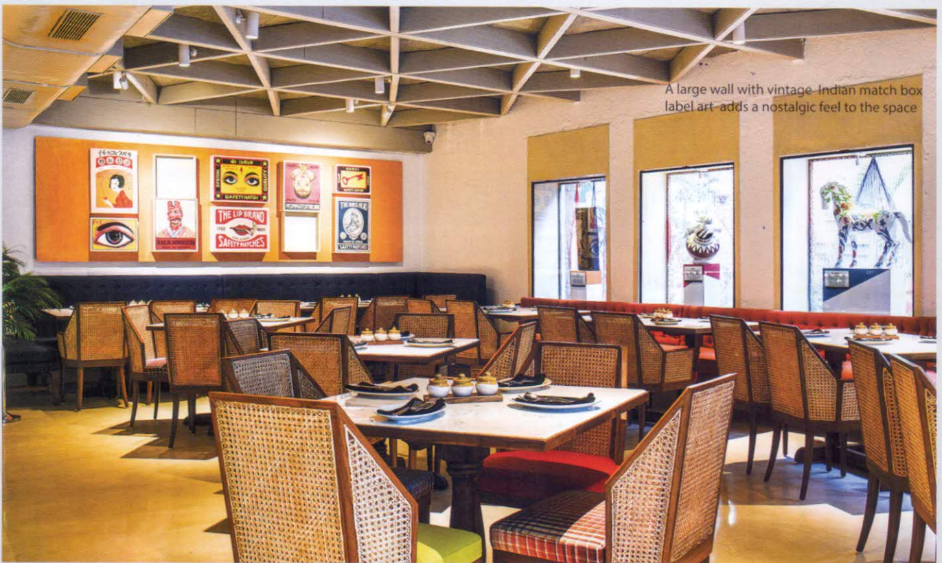
A large wall with vintage Indian match box label art adds a nostalgic feel to the space

“The interiors of the restaurant have been effectively adorned with art installation which are housed in the window niches with colourful thread work screens serving as a backdrop to the sculptures as well as lending privacy to the diners inside”